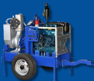
ORX 150 SE