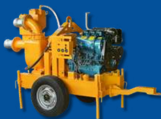
ORX 150 VS