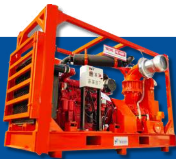
ORX 400 SE