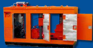
ORX 200 PC