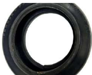
F80 Tyre Couplings