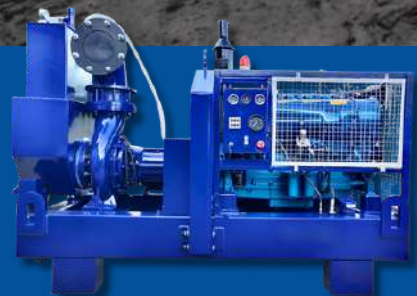
ORX 300 SE