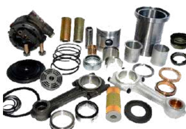
Engine Spare Parts